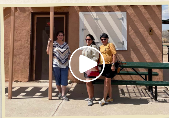
Play Avondale Grantee Video