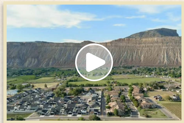
Play Clifton Video