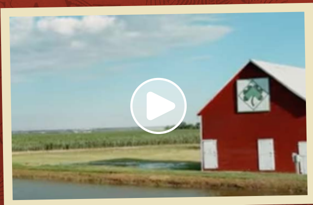
Play Culmination Grant Overview Video

Upon concluding this grant initiative in 2022, The Colorado Trust supported participating community teams in creating a lasting legacy of service to their neighbors and families. Through the 2022-2023 Culmination Phase grants, The Colorado Trust committed more than $6 million in final, one-time funding to grantee organizations working to address health inequities in their communities. The Culmination Phase grants augmented work that had already been underway as well as boosted new initiatives that will have lasting impact on the health and well-being of individuals and communities across our state.