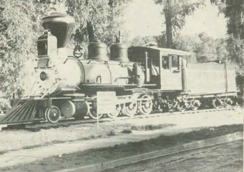
OLD SMOKE AND CINDERS, NO. 60, IDAHO SPRINGS DENVER & RIO GRANDE ENGINE NO. 315, DURANGO

Central City: Engine No. 71, 2-8-0 type, ex-C & S RR, built in 1897 as No. 9 of the Union Pacific, Denver & Gulf RR.