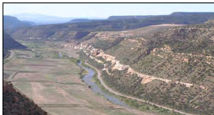
Today, nothing remains of the mill or the former town.

Schedule for Deletion: Site deletion from the NPL is anticipated to occur in 2015.