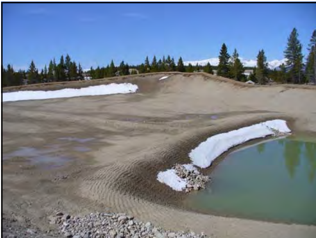
The new repository will be used to dispose of contaminated residential soil from Leadville.

Estimated State-Funded Costs: The OU6 remedy work is currently estimated to cost about $13 million which would include the state's cost share of $1.3 million. Remedy costs for OU12 are estimated to be approximately $250,000 per year for five to ten years. Settlement funds received from Newmont are expected to cover these costs. However, if