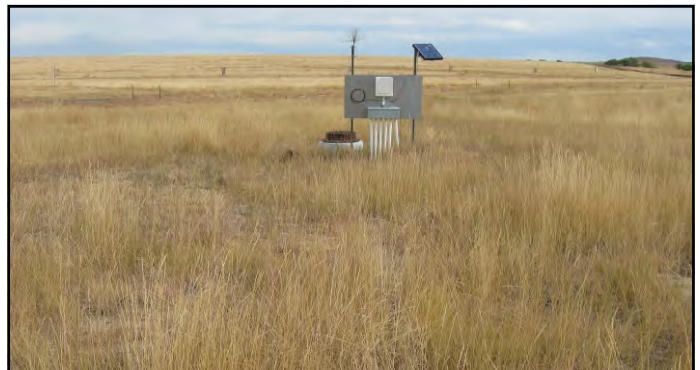
A lysimeter measures moisture infiltration to ensure that landfilled waste stays dry.

By September 30, 2010, an additional (approximately) 2,800 acres of cleaned up property was deleted from the NPL and added to the Wildlife Refuge land. It is not known when the underlying groundwater on the central portion of RMA and in the off-site plumes migrating north and northwest of RMA will meet cleanup standards and permit groundwater deletion, but it is generally expected to take at least a century. Most of RMA's surface property has now been deleted from the NPL with the caveat that the current institutional/land use controls must still remain in place. In addition to the approximately 1,000 acres that will be retained by the Army, there is a minor amount of surface land that could be eligible for deletion in the future, but it is unclear at this time when that will occur.