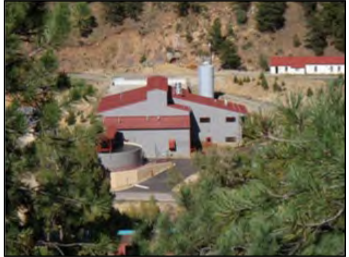
The Argo Tunnel Water Treatment Plant

Construction completion for the entire site is currently estimated to occur by December 2016, with deletion to follow.