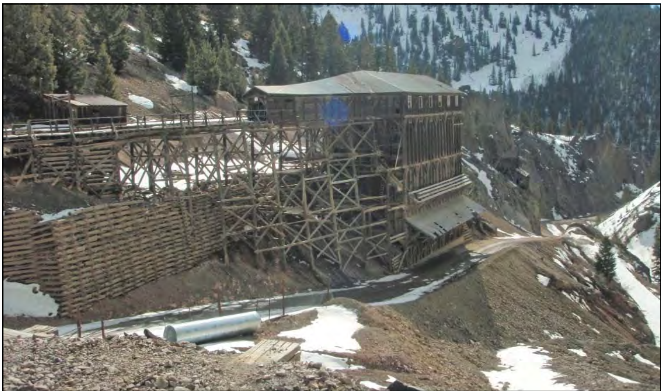
Nelson Tunnel / Commodore Mine Superfund site.

The department's mission in this program is to protect public health and the environment by cleaning up sites that are contaminated with hazardous substances in a cost-effective and timely manner. This is accomplished through proper remedy selection and by recovering costs from responsible parties, whenever appropriate and possible. The department seeks out and values the opinions of local communities and public officials in the decision-making process ensuring that selected remedies are acceptable to the affected stakeholders.