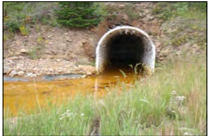
Big Five Tunnel at the Captain Jack Mill.

Schedule for Deletion: At this time, no schedule has been developed for construction completion and deletion of the site. It is anticipated that the subsurface remedy will be constructed during 2015, followed by two years of monitoring. If water quality standards are not met after construction of the bulkhead in the Big Five tunnel (Phase I), a biochemical reactor will be designed and constructed outside of the adit (Phase II). Phase II will require one year for design, one year for construction and another year to develop the deletion package. Therefore, the earliest the site could be considered for deletion would be roughly 2020.