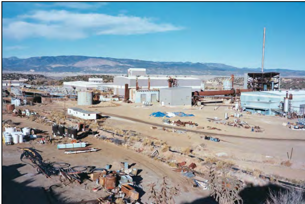
Cotter site, prior to dismantling.

Schedule for Deletion: Deleting the Lincoln Park Operable Unit site from the NPL cannot occur until groundwater in the area meets standards and has met the CERCLA process requirements. The timeframe for achieving these standards is unknown at this time.