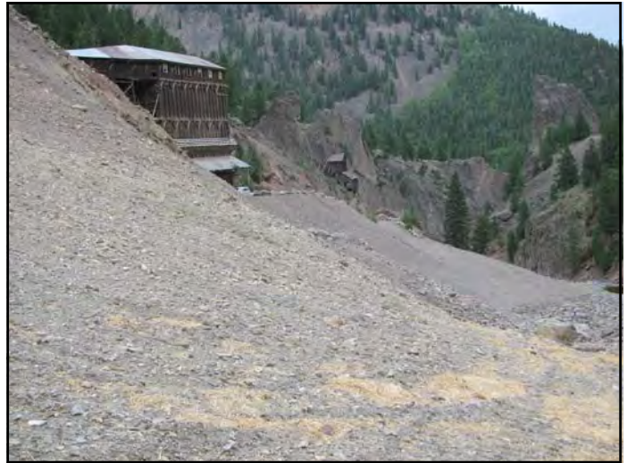
The mine features historic structures including ore bins.

Schedule for Deletion: Unknown at this time.