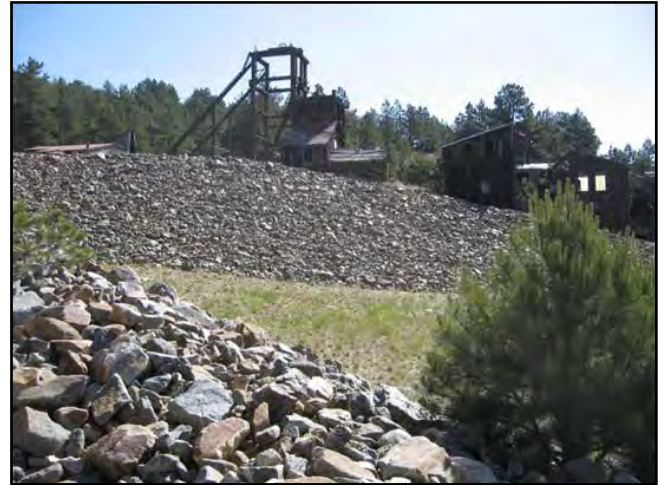
Pittsburg Waste Rock Pile

Description: The Central City/Clear Creek Superfund study area covers the 400-square mile drainage basin of Clear Creek, which has been affected by a number of inactive precious metal mines. To date, the Superfund investigation has focused on six priority mine drainage tunnels and more than 40 priority mine waste piles. The most significant environmental impacts are on the Clear Creek stream system, including a reduced fishery and impacts to other aquatic life and habitat. Acidic water draining from many mines contains a variety of heavy metals and mine wastes, which contribute to the non-point source impacts to the basin. Clear Creek is a drinking water source for more than 250,000 people living in the northern Denver metropolitan area and is used for kayaking, rafting, fishing, wildlife watching and gold panning. The human health hazards from this site involve the potential for exposure to heavy metals — primarily lead, arsenic and cadmium — in surface water and soils.