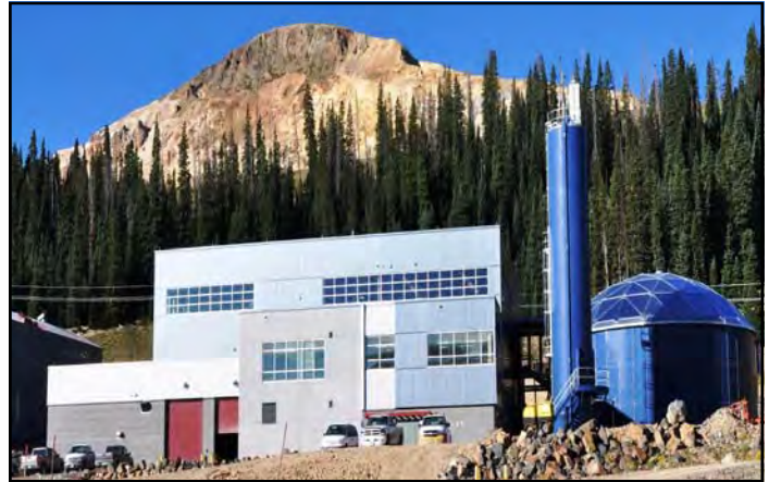
The new water treatment plant treats 1,600 gallons per minute. A micro-hydroelectric plant generates supplemental electricity

Construction completion for all structures and improvements identified in the Summitville Record of Decision 2001 are complete as of September 2012. EPA will cost share at 90/10 federal/state until the year 2021. In year 2022, the department will assume 100 percent responsibility for the new water treatment plant.