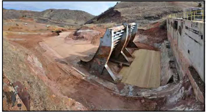
Research involving this rocket test stand resulted in soil and water contamination including volatile organic compounds, hydrocarbons, rocket fuel, organic and inorganic compounds and radionuclides.

Schedule for Deletion: In March 2001, the United States completed the sale of the U.S. Air Force Plant – PJKS to the Lockheed Martin Corporation. Lockheed Martin also owns the surrounding Lockheed Martin Astronautics Facility. Lockheed Martin has expressed a desire to have PJKS deleted from the NPL. However, neither Lockheed Martin nor the U.S. Air Force has formally approached the department or the EPA regarding deletion.