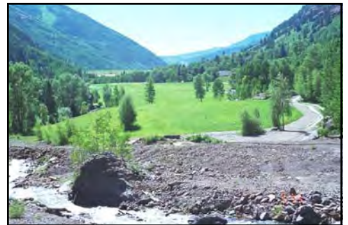
Idarado Mine site.

Schedule for Deletion: This site is not on the NPL and will not require deletion.