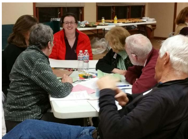
GCRHN and community partners engaged in community visioning.

In reflecting on the growing capacity of the region to participate in an emerging statewide health equity advocacy field, Fanning observes an evolution of their local community that has mirrored the organization’s development. As a result of dialogue and trainings spurred through GCRHN’s participation in Phase 2, she is now seeing increased alignment of values on health equity-related issues so that local organizations can quickly mobilize on issues of shared concern. As evidence, she relayed two examples of successfully addressing county decisions to: (1) shut down a home health program that serves the region’s elderly and disabled populations, and (2) make changes to the flu vaccine program that would disproportionately impact the region’s poor. Fanning explained, “Community partners are just more coalesced [than we were two years ago]” such that they are able to urgently call upon each other for support without having to take the time to even explain why [raising our collective voices] is important.”