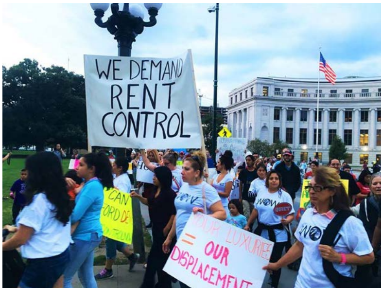
FRESC's WOW leaders march to demand solutions to Denver's housing crisis

diverse group of predominantly low-income people who have been directly impacted by displacement and rising housing costs. To support the committee's advocacy efforts, FRESC provided biweekly organizing and policy trainings, regular one-on-one leadership development, opportunities for community leaders to exercise their leadership skills through facilitated meetings with decision-makers and policy experts, and opportunities to testify at city council meetings and address the media as community spokespeople.